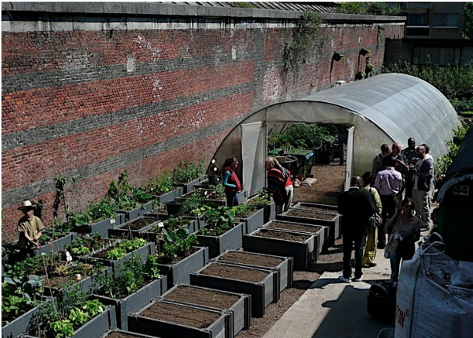
THE PILOT VEGETABLE GARDEN of La Pépinière in June 2010.